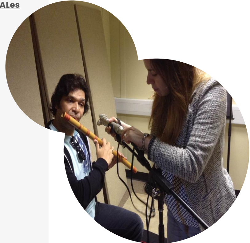
Bansuri recording session with Rakesh Chaurasia