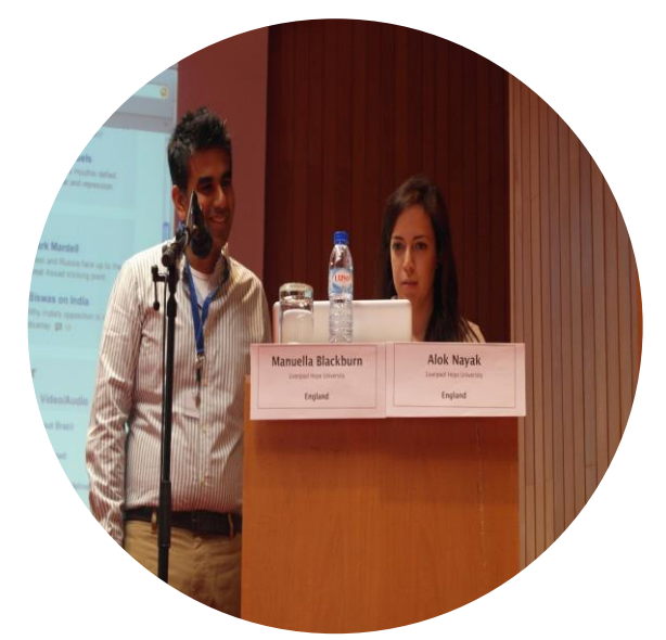
Presenting a conference paper together at the Electroacoustic Music Studies Network Conference