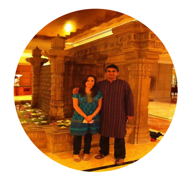
Recording work in Chennai, India